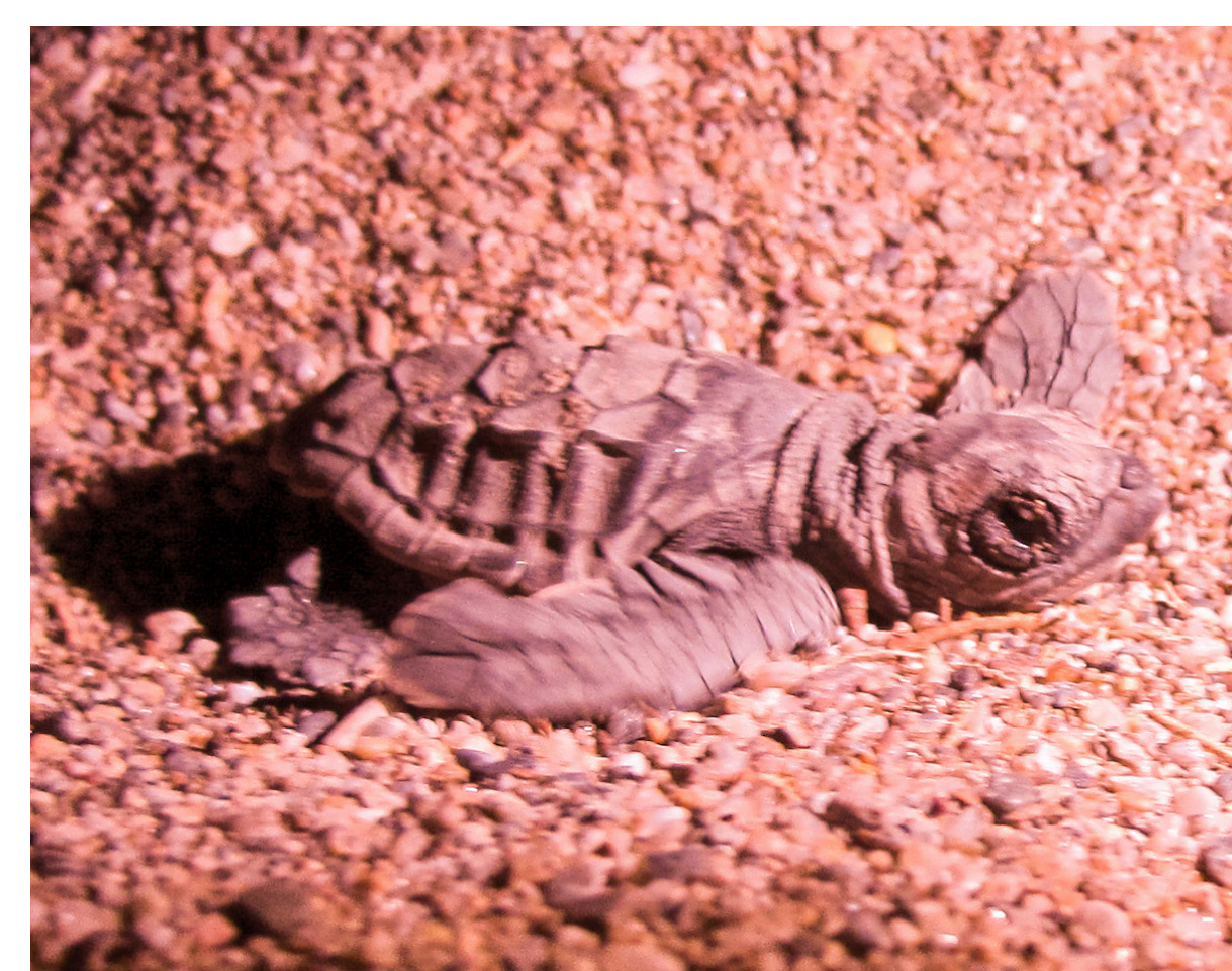
Fig. 2: Specimen of C. caretta hatchling on Kampos beach.

The stranding response in the last five years shows the presence of both species in the area. Historical data demonstrates the presence of nests on both islands (Delaveri K., personal communication). Samos and Lipsi Islands show several beaches suitable for nesting of sea turtles. On one of them (Kamos, South-West Samos), characterised by a very coarse sand with pebbles and high human presence, three C. caretta nests were patrolled during the nesting season of 2018 (Tab. 1).