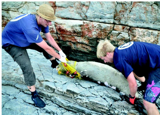
Figure 4. A juvenile M. monachus entangled in an artisanal fishing net

The incidents of depredation of Mediterranean monk seals Monachus monachus , with artisanal fishing gear, and both nets and long-lines have been increasing since 2000, with more incidents being recorded and reported in the south-eastern Aegean Sea, than in the north-eastern Aegean Sea, likely reflecting the larger monk seal population in the SE Aegean. In a study carried out in 2014 assessing the interactions between monk seals and the artisanal fishery of the small island of Lipsi in the SE Aegean, (Rios et al. , 2017), evidence of depredation by monk seals was recorded in 19.1% of fishing journeys compared to 5% by cetaceans. Analysis of landings data showed that gear and depth were the variables most likely to influence the occurrence of depredation, whereas the total cost of monk seal depredation was estimated to be 21.33% of the mean annual income of the artisanal fishermen.