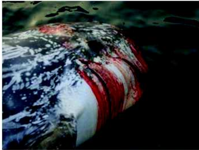
Figure 3. Stranded G. griseus with marks of deliberate killing.