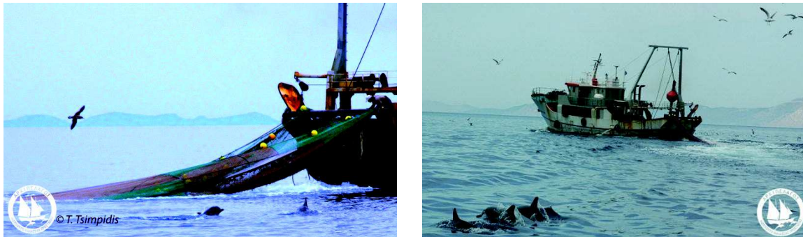
Figure 1. Interaction of T. truncatus (left) and D. delphis (right) with trawlers

Between 2000 and 2010, the Bottlenose dolphin Tursiops truncatus was the only cetacean species that was recorded to depredate both artisanal fishing gear and trawlers. Depredation behavior on artisanal fishing gear was mainly recorded by solitary dolphins or small pods, rather than larger pods that rarely showed such a behavior. Since 2010, the Common dolphin Delphinus delphis was also observed to start demonstrating gradually a depredation behavior, initially interacting with benthic trawlers and since 2013 with artisanal nets.